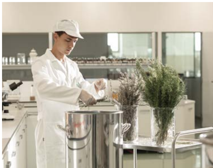
2 Organic Ingredient Extraction Estrazione Ingredienti Bio