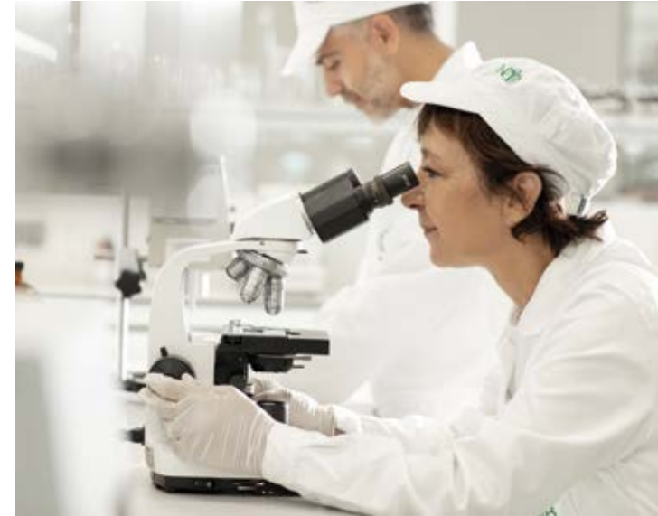
3 R&D and Innovation Ricerca & Sviluppo e Innovazione