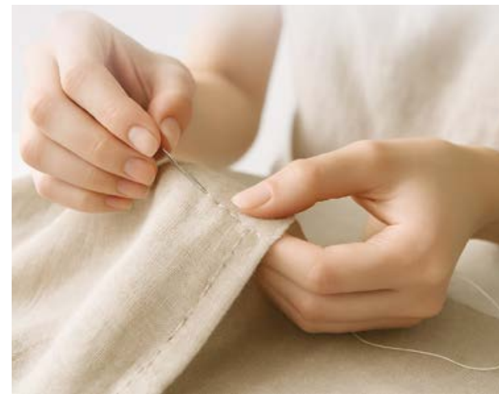
5 We Realize Your Customized Product Creiamo il tuo Prodotto su Misura