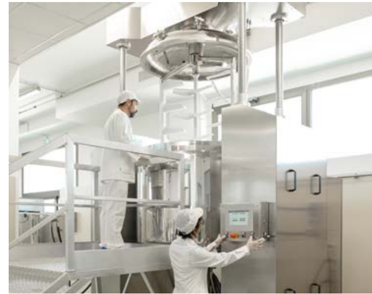
4 Innovative Production & Technology Produzione & Tecnologie Innovative