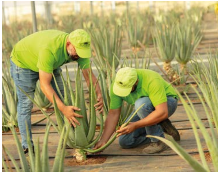
1 Organic Regenerative Farming Agricoltura Biologica Rigenerativa